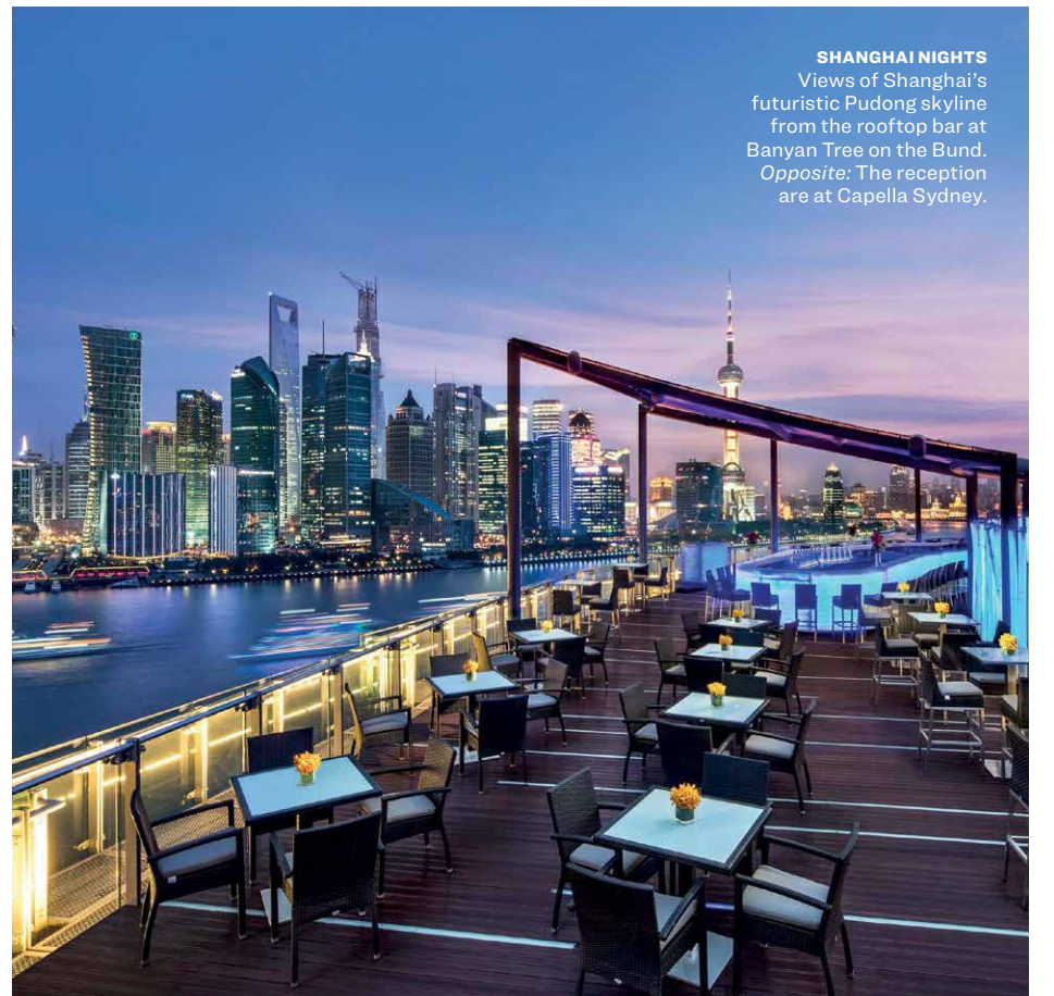
SHANGHAI NIGHTS Views of Shanghai's futuristic Pudong skyline from the rooftop bar at Banyan Tree on the Bund. Opposite: The reception are at Capella Sydney.