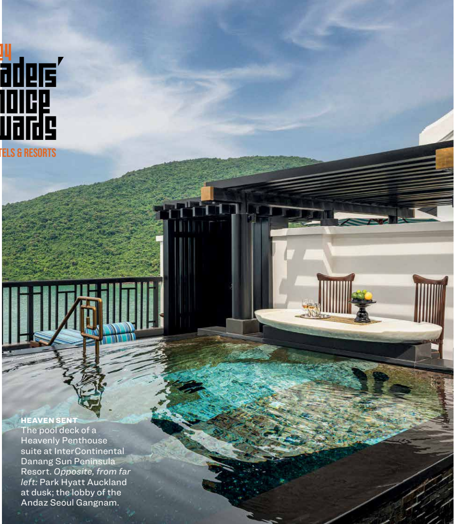
HEAVEN SENT The pool deck of a Heavenly Penthouse suite at InterContinental Danang Sun Peninsula Resort. Opposite, from far left: Park Hyatt Auckland at dusk; the lobby of the Andaz Seoul Gangnam.